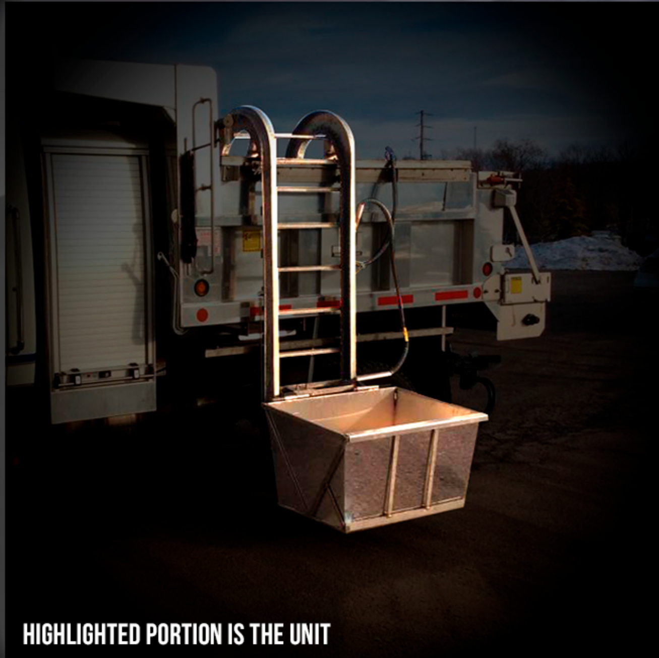
HIGHLIGHTED PORTION IS THE UNIT

UNIT IS THE SAME WITH A DIFFERENT MOUNT FOR NUMEROUS DIFFERENT APPLICATIONS.